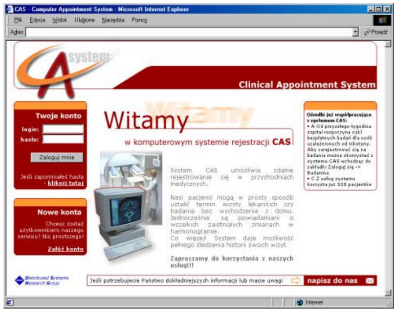
Fig. 5. CAS on a PC display

CAS was deployed in a John Paul II hospital in Cracow in order to validate its usability and usefulness.