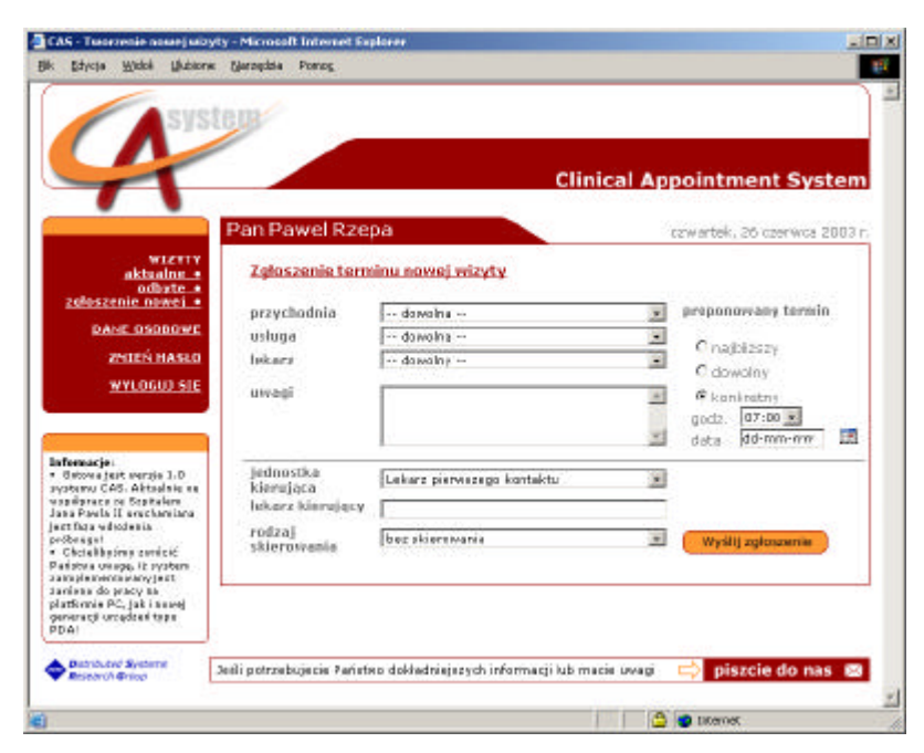
Fig. 2. Creation of a new appointment

Application distinguishes three separate group of users that access its functionality. Besides patients and appointment clerks described previously there are administrators who handle all issues concerning managing the system e.g. adding clinics, doctors, appointment clerks etc.